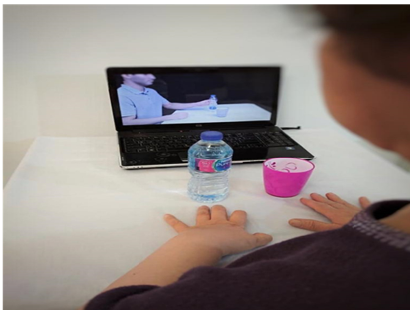
Fig. 1. EZ is watching and imitating a video of a Healthy Model (AOT)