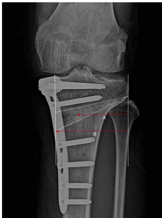
Figure 3 The result of (Line A/ Line B) \times 100 was the rate of osteotomy gap union.