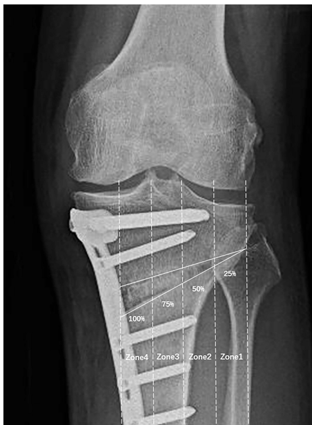
Figure 2 The osteotomy space was divided into the lateral hinge and four equally spaced intervals on the medial-lateral radiograph of the knee joint.