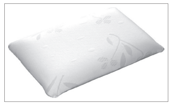
FIGURE 1: Visco-elastic polyurethane Memory Foam® pillow (62 cm \times 40 cm \times 12 cm).

In addition, the present study utilised the NDI, which is a valid and reliable (Ackelman & Lindgren 2002) revised version of the Oswestry Index, which measures the impact and effect of neck pain on the day-to-day life of patients (Vernon 1996). Using this questionnaire, each participant was required to complete the questionnaire by indicating which statement best suited and described their condition using a rating of 0–5, with 0 indicating the least impact and 5 the highest. The NDI has 10 sections to be completed with a possible maximum score of 50 points. An advantage of using the NDI scoring system is that the MCID can also be determined. Specifically, Young et al. (2009) indicated that an MCID in the NDI of 7.5 points equates to a 15% improvement in neck pain and the patient's day-to-day life.