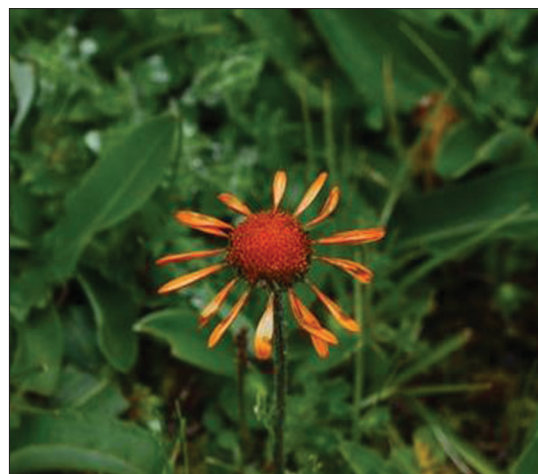
Figure 1: Pyrethrum tatsienense (Bur. et Franch.) ling

DPPH radical and \alpha -tocopherol were obtained from Sigma Chemical Company (USA). The 11 flavonoids were isolated from ethanol extracts of P. tatsienense by the measures of normal phase, reversed phase, sephadex LH20 and molecular