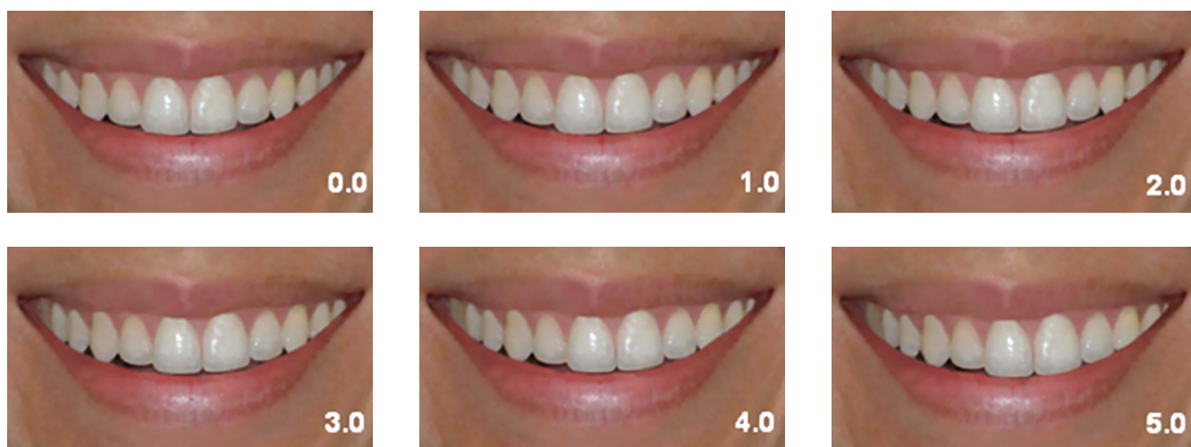
Figure 2 - Group L photographs: the numbers on the photographs indicate the amount of deviation in millimeters.