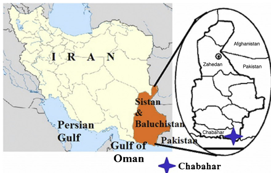
Fig. 1. Map of Iran showing our study area. Sistan and Baluchistan Province is located in southeast of Iran. Chabahar County is bordered with Pakistan and Gulf of Oman.

During the springtime of 2015, ticks infesting goats, sheep, camels and cows were collected (Fig. 1). In cases of infestation, ticks were collected, ensuring correct personal protective equipment (PPE) was worn and by using forceps to remove the ticks from livestock. All specimens were preserved in tubes and relative information was recorded. Specimens were transferred to the Entomology Laboratory, School of Public Health, Tehran University of Medical Sciences, Tehran, Iran. Ticks were identified to the species level by Janbakhsh and Walker keys [12].