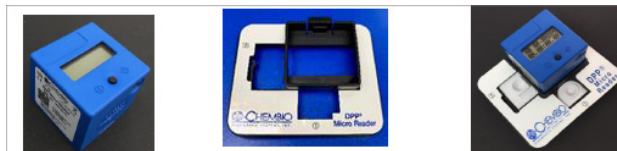
Figure 4 DPP microreader, test device holder, DPP microreader with test device holder and test device. DPP, dual path platform.

Recently, the Chembio Company developed the DPP microreader (MR) to complete the Chembio DPP technology and minimise error due to subjective visual interpretation (figure 4). The DPP MR is a portable, battery-powered instrument that uses assay-specific algorithms to analyse the test and control line reflectance to determine the presence or absence of the antibodies to HIV and/or TP in the sample. The device is fitted to the Chembio POCT via a dedicated holder. The reader verifies the presence of the control line and measures colour intensity at each of the test line positions; it interprets the results using an algorithm including assay-specific cut-off values, and reports a positive, negative or invalid result. 20