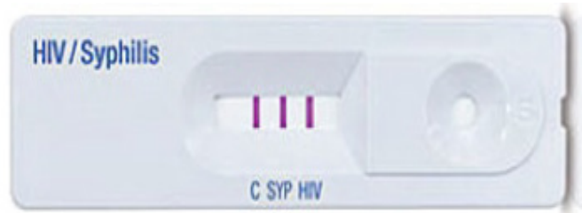
Figure 2 Bioline point-of-care test.

on themselves believing that the test is accurate and convenient. In turn, if acceptability and usability are high among both providers and users, then implementation is feasible.