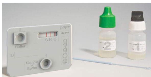
Figure 3 Chembio point-of-care test kit. DPP, dual path platform.

The tests to be evaluated will be SD Bioline HIV/Syphilis Duo (Abbott Diagnostics, USA; hereafter termed Bioline POCT) (figure 2) and Chembio Dual Path Platform (DPP) HIV-Syphilis Assay (Chembio, United States; hereafter termed Chembio POCT) (figure 3). Both will be single-use qualitative immunochromatographic assays for the simultaneous detection of antibodies against HIV types 1 and 2 (HIV 1/2) and/or Treponema pallidum (TP) in human serum, plasma, whole venous or finger pricked blood. In 2015, the Bioline POCT was accepted for the WHO list of prequalified in vitro diagnostics. 19