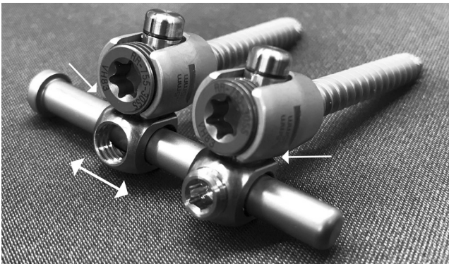
Fig. 1 KAPSS system (Robert Reid, Tokyo, Japan) for ADS using titanium-alloy pedicle screws, connectors, and rod with a stopper is shown. Perpendicular movement is allowed on the rostral connector site (double-headed arrows) and sagittal movement with 20° each way is allowed on the both connector sites (arrows). ADS: advanced dynamic stabilization.

SPSS ver. 24, \chi^2 test and Mann–Whitney U test. NA: not applicable, LDS: lumbar degenerative spondylolisthesis, LDD: lumbar disc degeneration with apparent vacuum phenomenon, L: lumbar, S: sacral, Postop.: postoperative, Preop.: preoperative, JOA: Japanese Orthopaedic Association