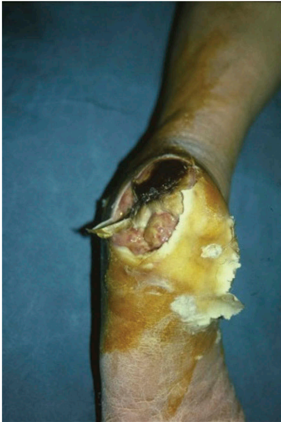
Figure 2. A 72-year-old male presented with a large diabetic foot ulcer over the left heel.

(Figures 3 and 4). The pin site infections were defined as minor or major according to the Checketts–Otterburn classification [11]. The external fixator was removed after a mean of 8.2 weeks (range 7–10 weeks) and a custom-made ankle–foot orthosis with a soft inner foam lining and a dense outer foam heel was ordered.