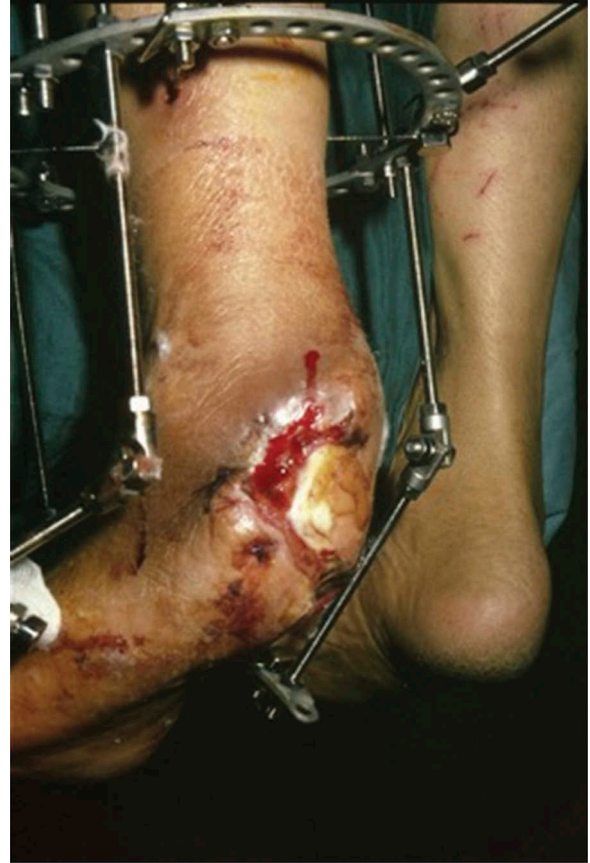
Figure 3. The culture was positive for Staphylococcus aureus and Pseudomonas aeruginosa . After surgical debridement and partial calcanectomy, an Ilizarov external fixator with hinges was applied to decrease the soft-tissue defect in the equinus position.

The outcome data are presented in Table 1. Wagner grade II pedal ulcer was determined in 11 patients and Wagner type III in 12 patients. Of these, osteomyelitis was diagnosed in 17 patients. Preoperative evaluation of the extent of the infection almost totally