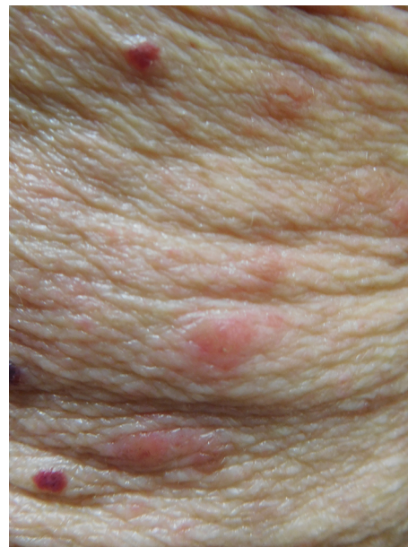
Figure 2 Bullous scabies mimicking bullous pemphigoid.

Notes: The chest and abdomen of a 76-year-old man show the new appearance of pruritic pinkish-red dermal plaques. Angiomas, present as dark red nodules, are also numerous.