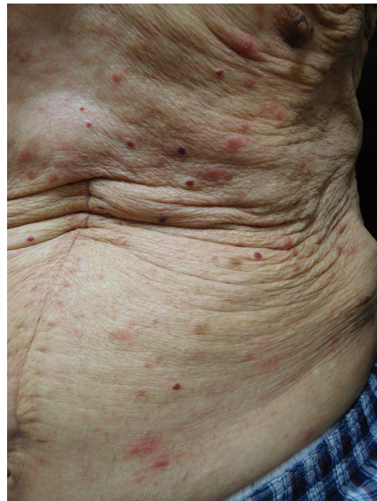
Figure 1 Scabies masquerading as bullous pemphigoid.

The direct immunofluorescence microscopy revealed linear deposition of IgG and complement component C3