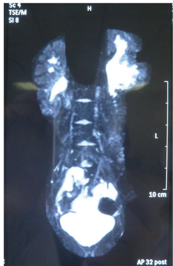
Figure 2. Magnetic resonance imaging.

In the past, pediatric hydronephrosis was identified when patients received abdominal ultrasound screening due to abdominal mass and abdominal pain. Now, pediatric hydronephrosis can be diagnosed prenatally (5) and closely followed up in postnatal examination (1,6,7). Follow-up program development is based on the hydronephrosis classification (8). With an increase in the follow-up observation and in-depth understanding of pediatric hydronephrosis, pediatric ARP may be detected and verified.