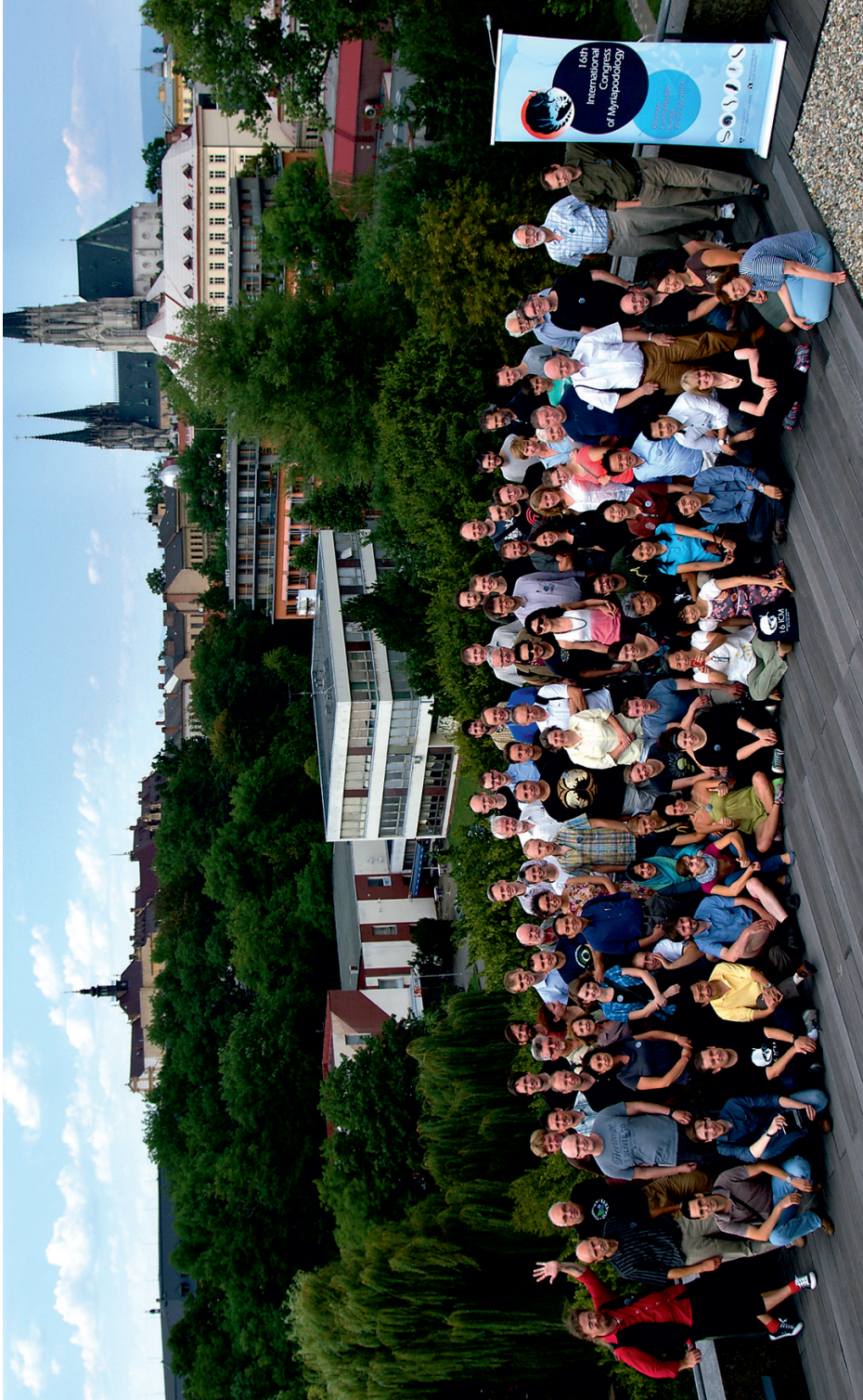
Figure 1. Collective photo of 16ICM participants.