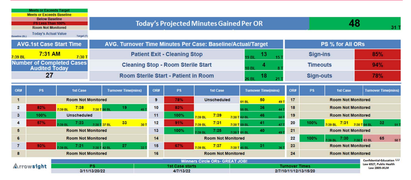
Figure 3 OR safety and efficiency metric display board during intervention phase. BL, baseline; T, target time in minutes; PS, patient safety; OR, operating room.

Inter-rater reliability for RVA with a sample of four auditors was estimated by examining the surgical safety checklist compliance and time segment metrics for 30 randomly selected cases. Intraclass correlation coefficients and Fleiss' kappas were determined for segment durations and checklist compliance metrics.