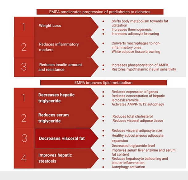
FIGURE 2: Summary of the mechanisms impacted by EMPA.

All the studies included here are placebo-controlled. The duration of studies ranged from eight weeks to three months, including three that have the same eight weeks endpoints. Overall, the mentioned human studies were comparable in aspects of age, body mass index (BMI), and hepatic lipid status as the criteria of the patient for inclusion in human studies, whereas in animal studies, prediabetic hepatic lipid status was the selection criterion. In general, a low risk of bias is observed. In most of the studies, it is notable that EMPA improved hepatic lipid metabolism, hepatic steatosis, insulin sensitivity, fasting glucose level, and reduced body weight in some studies. Although there are reasonable amounts of animal trials available, slender amounts of human trials and shorter periods of study duration can be proved as major drawbacks. In Figure 2, we summarize the mechanism of EMPA [3].