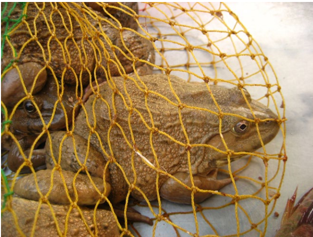
FIGURE 1 Hoplobatrachus rugulosus sold alive on a local market in Bang Phra subdistrict, Chon Buri province, Thailand.

For comparative isotopic data, we screened the literature for amphibian species reflecting different trophic systems/classifications, body sizes and ecological niches (leaf litter frogs, tree frogs, terrestrial or aquatic species), because all these factors could influence stable isotope composition (Bearhop et al., 2004; Fry, 2006; Jefferson & Russel