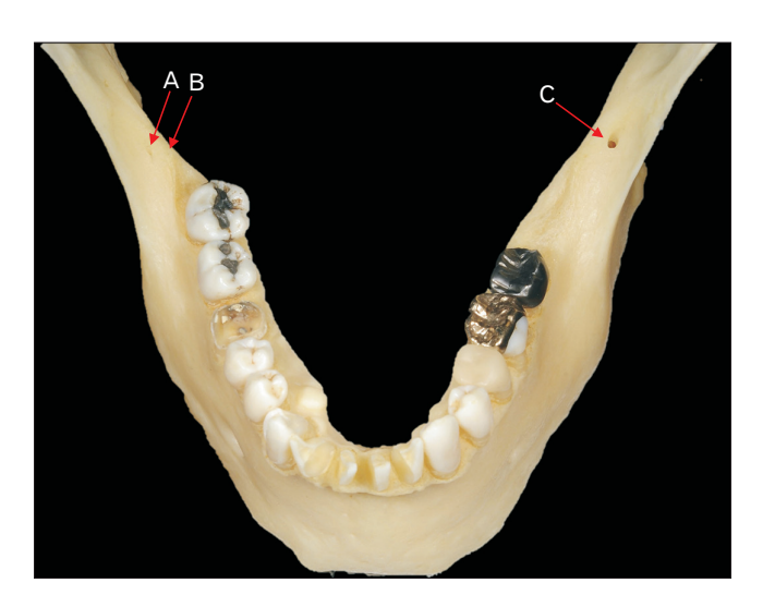
Fig. 1. A dry mandible demonstrating double retromolar foramina on the right (A, B) and a retromolar foramen on the left (C). The three retromolar foramina are labeled.

We present here a case of a trifid mandibular canal on the left and bilateral RMF, with a double RMF on the right side of the mandible.