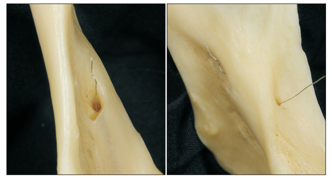
Fig. 2. Continuation of the retromolar foramen and superior canal on the left shown with a metal wire.

In this case, there was a mandibular trifid canal but only one left RMF with a diameter of 2.02 mm. It might be a type 5B canal according to the classification system by Rashsuren