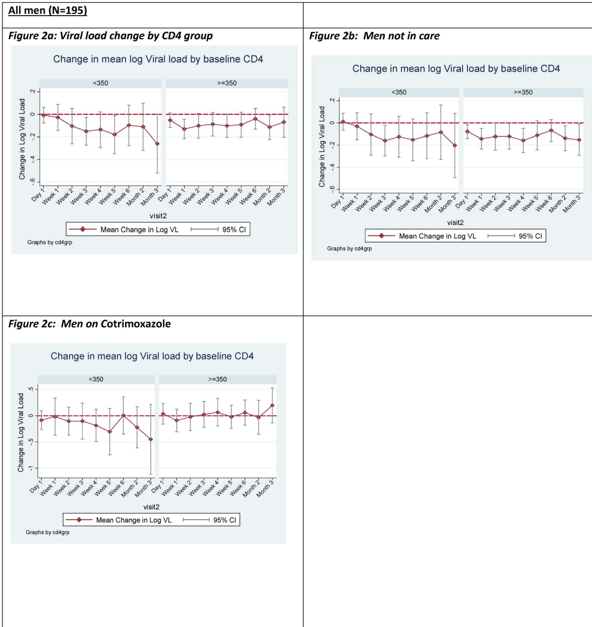
Figure 2. Graphs of mean differences in log 10 viral load relative to baseline by follow-up visit.