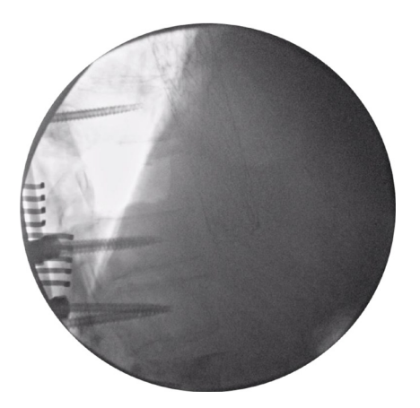
Figure 2 Intraoperative imaging showing placement of TEVAR graft via popliteal access. TEVAR, thoracic endovascular aortic repair.

arteries were controlled using 6-0 sutures and liga clips. Spinal reconstruction was then completed with the patient subsequently transferred to the intensive care unit for continued resuscitation and inotropic support. A follow up computed tomography (CT) angiogram was performed showing adequate placement of the TEVAR graft ( Figure 4 ).