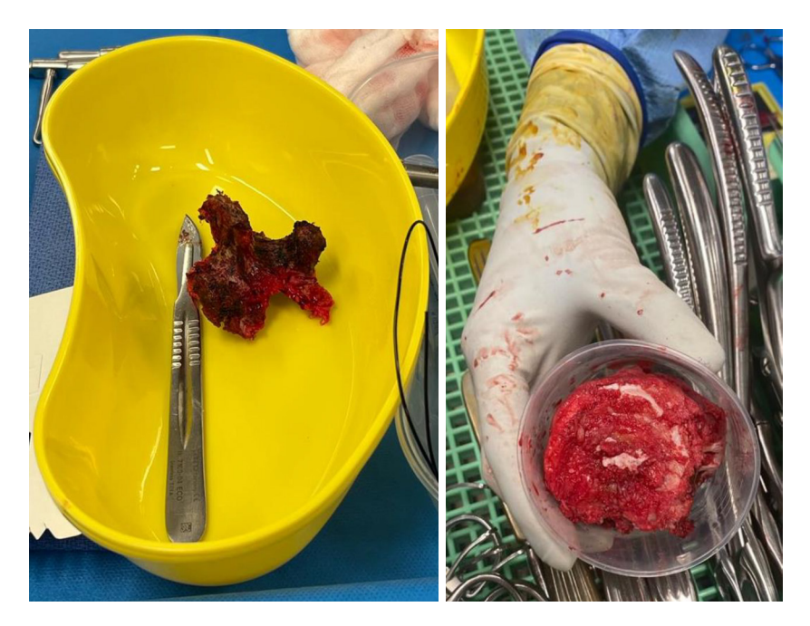
Figure 3 Intraoperative photographs of the posterior elements (left) and vertebral body (right) of the resected T11 vertebrae.