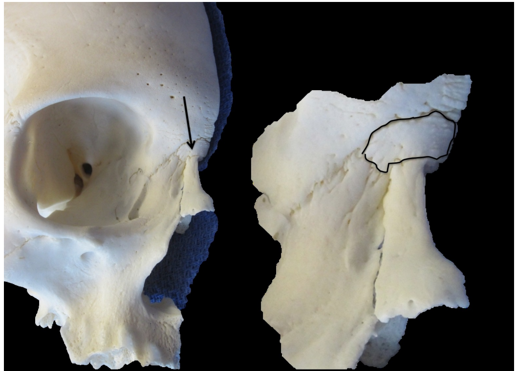
FIGURE 1: Skull specimen

posteriorly to the ethmoid bone. All sutures of the calvaria were closed, and there were no signs of craniosynostosis or major asymmetries of the skull. However, the overall size of the skull was small at 16 cm (anteroposterior length) x 13 cm (height). No other osteological variations were noted, other than a small (4 x 5 mm) right-sided pterional sutural bone and a left-sided small (4 x 5 mm) sutural bone in the lateral most part of the lambdoidal suture at the asterion.