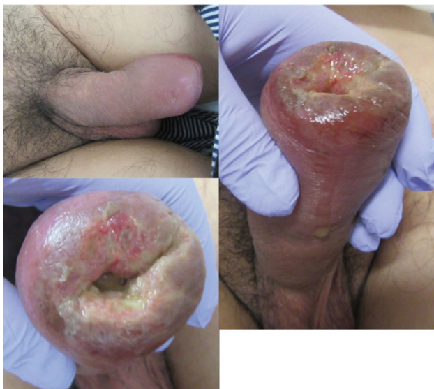
Fig. 1 Appearance of penis at the first presentation. The foreskin and glans are swollen, and erosion and pus discharge are seen. The urethral orifice was obstructed, preventing catheter insertion.

The patient usually used 0.025% BAC solution, but on vacation, he bought a different catheter from a different