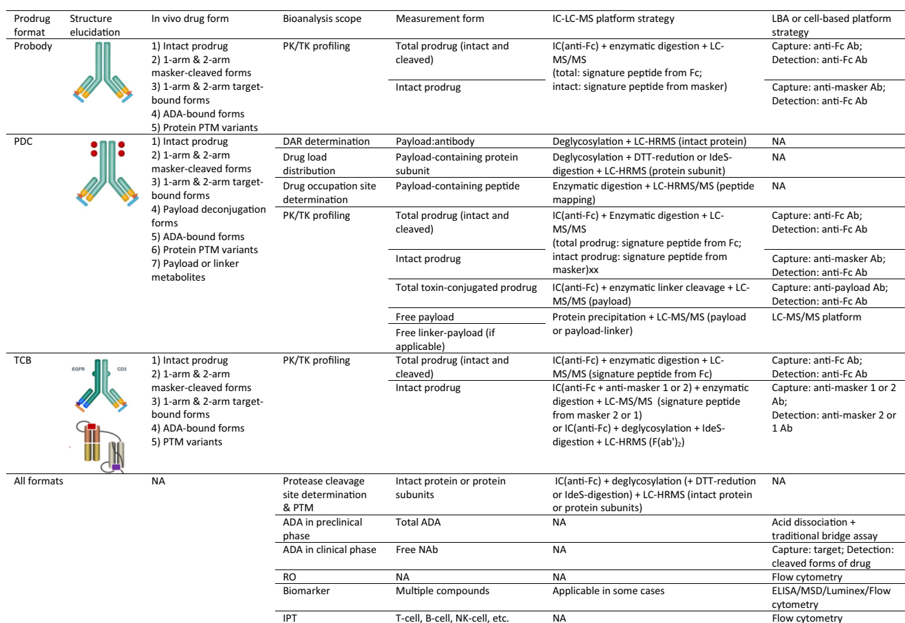
Table 3. Bioanalysis Platforms for Antibody Prodrugs

PDC pro-antibody drug conjugates, TCB T cell-engaging bispecific antibodies, IC-LC-MS immunocapture-liquid chromatography coupled with tandem mass spectrometry, LBA ligand binding assay, ADA anti-drug antibody, PK/TK pharmacokinetic/toxicokinetic, HRMS high-resolution mass spectrometry, DTT dithiothreitol, MSD Meso Scale Discovery, PTM posttranslational modification, DAR drug antibody ratio, RO receptor occupancy, IPT immunophenotyping, ELISA enzyme-linked immunosorbent assay