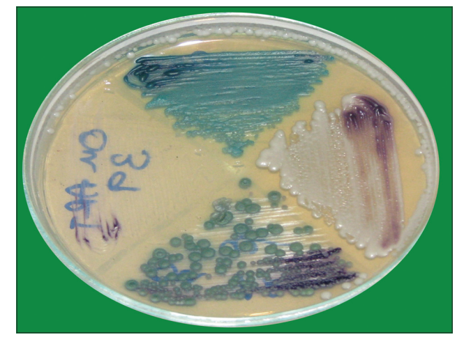
Figure 4: Colored candidal colonies on chrom-agar medium

Journal of Oral and Maxillofacial Pathology: Vol. 16 Issue 1 Jan - Apr 2012