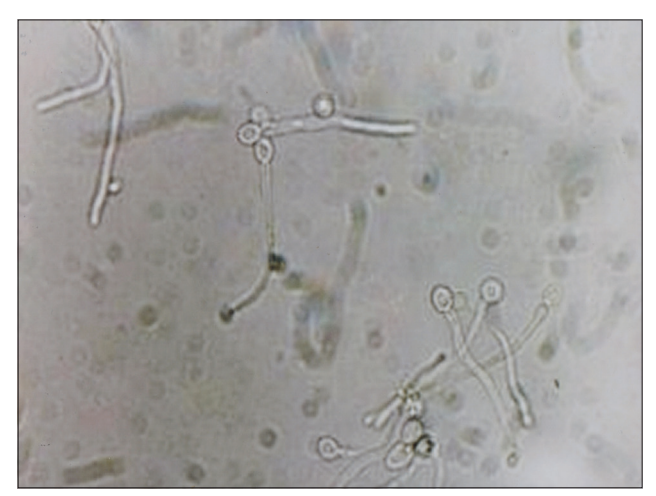
Figure 2: Germ – tube test (Reynolds Braude phenomenon)

Age-wise analysis showed a high positivity for Candidal culture in the age range of 41–50 years among the study Group I. In symptomatic cases, it was 31–40 years. Socioeconomic status showed a significant difference between the high and low income groups, with a statistically significant