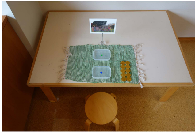
Figure 3. A photo of the experiment environment. Children sat at a desk and decided how to allocate ten chocolates. A male experimenter sat next to the child and explained the rules of the game to the children.

own resources to the recipients than were those in our study. Furthermore, paradigms used in previous studies did not incur a cost to participants to provide ingroup members with resources 38,39 ; this study required children to give up their own resources for the recipients, which may have diminished the desire to provide ingroup members with rewards. Consistent with this hypothesis, Fehr et al. 48 did not find ingroup favouritism in preschoolers using a sharing game similar to the paradigm used in our study, in which sharing was costly to participants. Furthermore, a recent neuroimaging study 59 showed that the cortical thickness of the dorsolateral prefrontal cortex, an area that plays an important role in executive function, positively relates to both age as well as the inhibition of the desire for economic interests in elementary school-aged children. Thus, it is likely that when children must allocate their own resources in order to provide resources to a recipient, it may be more difficult to observe effects of generosity or ingroup favouritism.