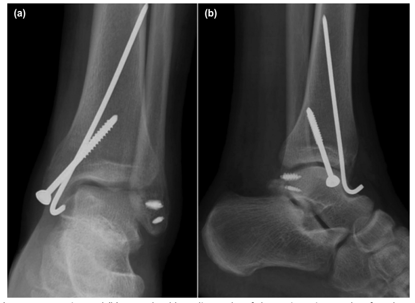
Fig. 3: (a) Anteroposterior and (b) Lateral ankle radiographs of the patient six months after the surgery.