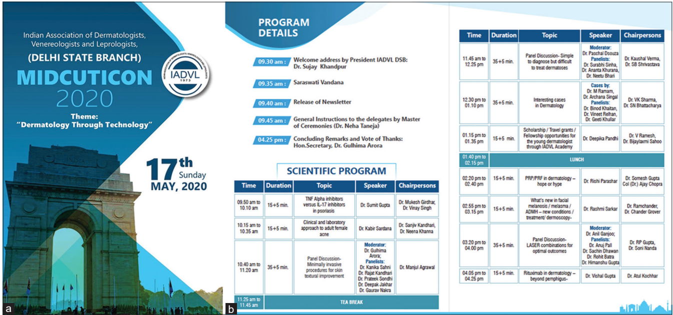
Figure 1: The conference theme (a) and conference program (b) for IADVL-Delhi State Branch MID-CUTICON 2020

wanted a platform with which the speakers and delegates were familiar with. In addition, ZOOM allows a smooth interface with multiple speakers from many locations to be accommodated at the same time and facilitates a connection with a large number of participants [Figure 3]. The delegates can engage with the speaker by texting their questions in the “chat box.” The audio and video inputs of all the faculty and delegates could be controlled from