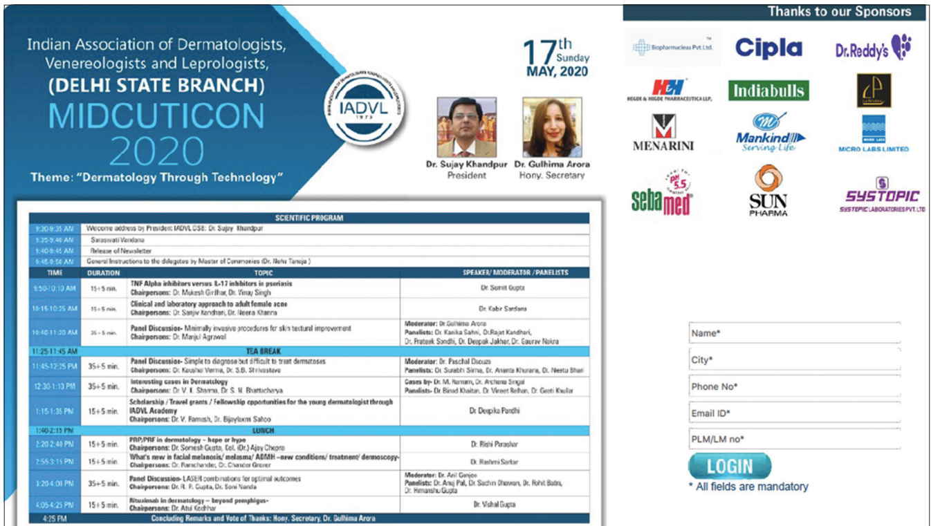
Figure 2: Registration page of the conference