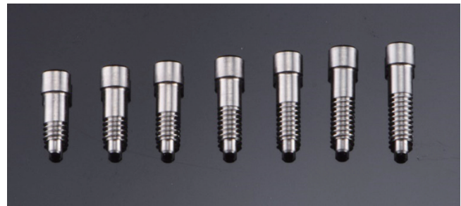
Fig. 1. A photograph of the abutment screws used in the current study. From left to right, the screws are 1.4 - 3.8 mm in length (in 0.4 mm increments) with 3.5 - 9.5 threads (in one thread increments).

were tightened with the abutment screws using a torque of 30 Ncm in accordance with the manufacturer’s recommendation. All screws were retightened 10 minutes later in the same way for minimizing embedment relaxation among the mated threads. 23 Measurements of RTVs were performed 5 minutes later with a digital torque gauge (MTT03-12, Mark-10 Co., Hicksville, NY, USA). These RTVs were measured before loading and were referred to as pre-RTVs. For cyclic loading, the screws were retightened as described previously. The implant-abutment assemblies were positioned into the metal holder (Fig. 2) at a 30° inclination relative to the axis of loading. A total of 35 metal caps were fabricated with hemisphere-shaped heads and attached to the abutments prior to loading with a zinc phosphate cement (Elite Cement 100; GC Co., Tokyo, Japan) as described previously. 11 Cyclic loading was conducted using a universal testing machine (E3000, Instron, Canton, MA, USA). For all assemblies, loads of 300 N were applied until one million cycles were achieved at a frequency of 15 Hz. Testing was performed in random sequences. After loading, the RTVs were measured again and referred to as post-RTVs. Differences between pre-RTVs and post-RTVs were calculated and referred to as RTV differences. Repeated measures analysis of variance with Student-Newman-Keuls multiple comparisons was performed to analyze the measured data. Statistical significance was set at a P value < .05.