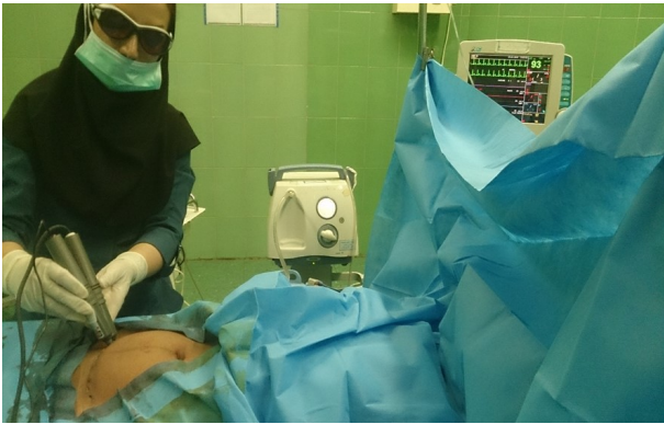
Figure 2. Laser radiation to surgical site

J IR + 1.5 J Red), and the total energy was 27 J.