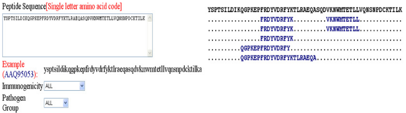
Figure 5 Mapping of B-cell epitopes on antigen sequence, a) submission page of B-cell epitope mapping, and b) mapping results

their experimentally determined B-cell epitopes. We hope that immunologists will submit their information on B-cell epitope in Bcipep, similar to the sequence data at GenBank and SWISS-PROT. The Bcipep team will add more data from literature to maintain B-cell data up-to-date and cross check the data submitted by users to maintain quality of the data.