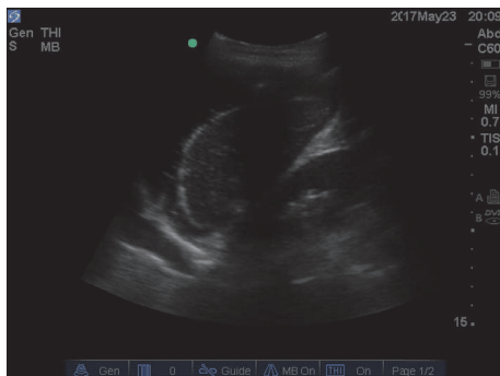
FIGURE 2: Longitudinal image of the left upper quadrant. Fluid can be seen not only surrounding the spleen, but also superior to the diaphragm on the far left of the image.