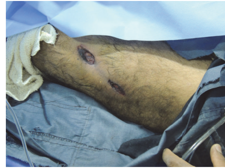
FIGURE 3: Lesion noted to the left anterior thigh with charred edges, possibly representing a burn.