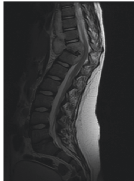
FIGURE 2: Contrasted magnetic resonance imaging (MRI) of the spine shows kyphotic destruction of thoracic vertebrae T10, T11, and T12 with abnormal high signal on T2 and low signal on T1 with heterogeneous enhancement in addition to a large heterogeneous paravertebral multiloculated prevertebral and paraspinal abscess extending from T7 through T12 with a peripheral thick wall that has low T2 and high T1 signal with intense enhancement. These are associated with an epidural collection and retropulsed collapsed T11, which result in complete attenuation of the anterior subarachnoid spaces and compression of the distal cord.

may be absent [8]. Affected children are at risk of severe vertebral destruction and complications because of the cartilaginous nature of their bone as well as late diagnosis secondary to nonspecific clinical symptoms and the slowly progressive course of the disease [9].