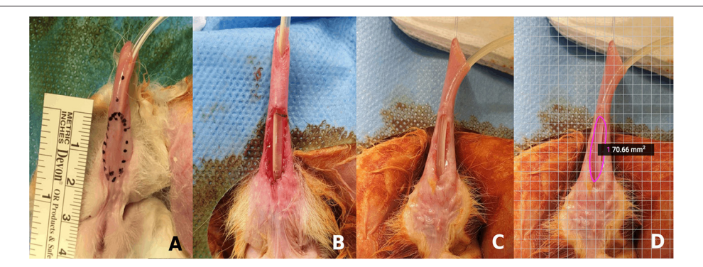
FIGURE 1 | Chronic large urethral defect model: (A) Rabbit penis with the drawing of the area of urethral resection to create the defect. (B) Large urethral defect newly created. (C) Chronic large urethral defect after 3 months. (D) Calculated area of the urethral defect (SketchAndCalc<sup>TM</sup> application).