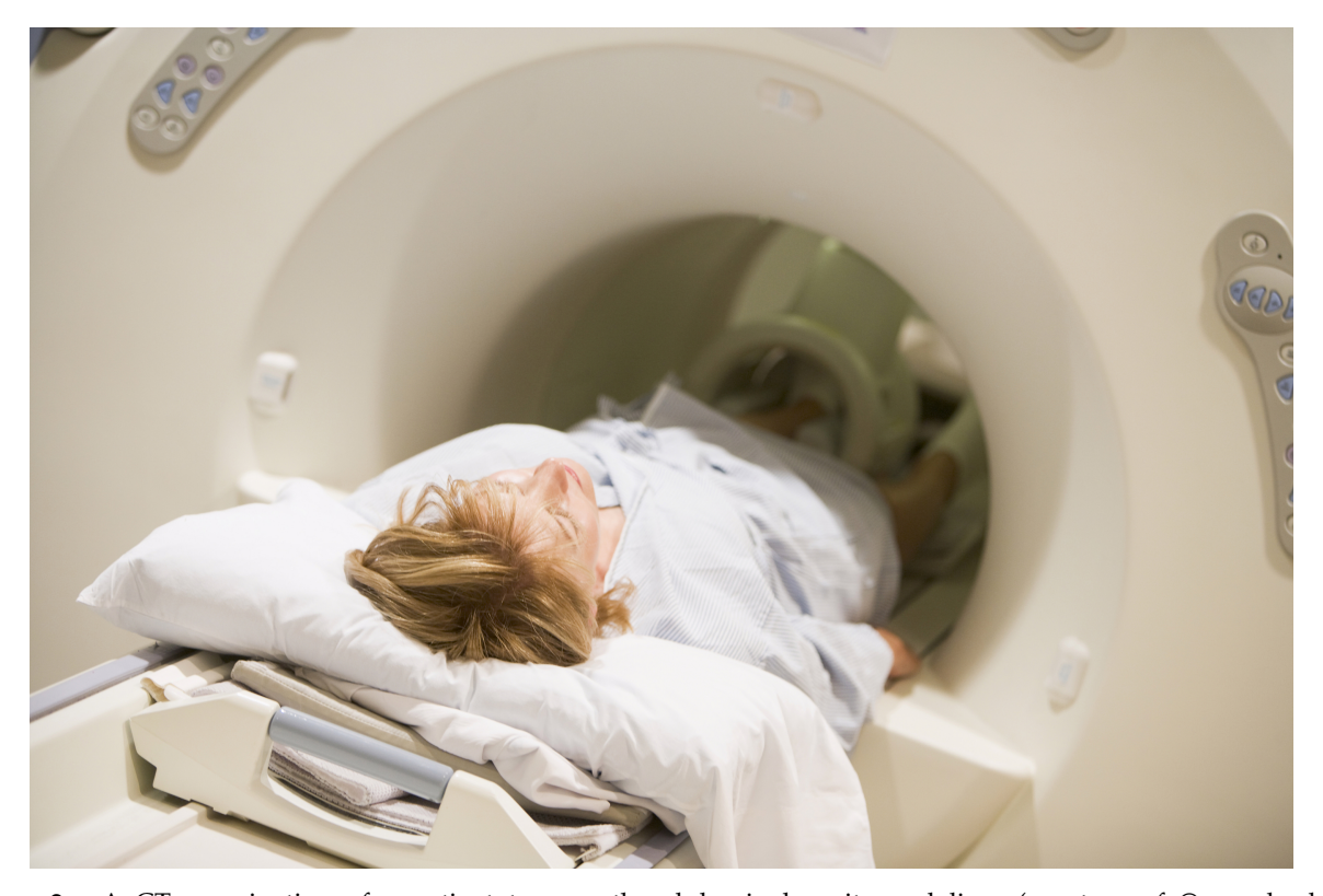
Figure 2. A CT examination of a patient to scan the abdominal cavity and liver.