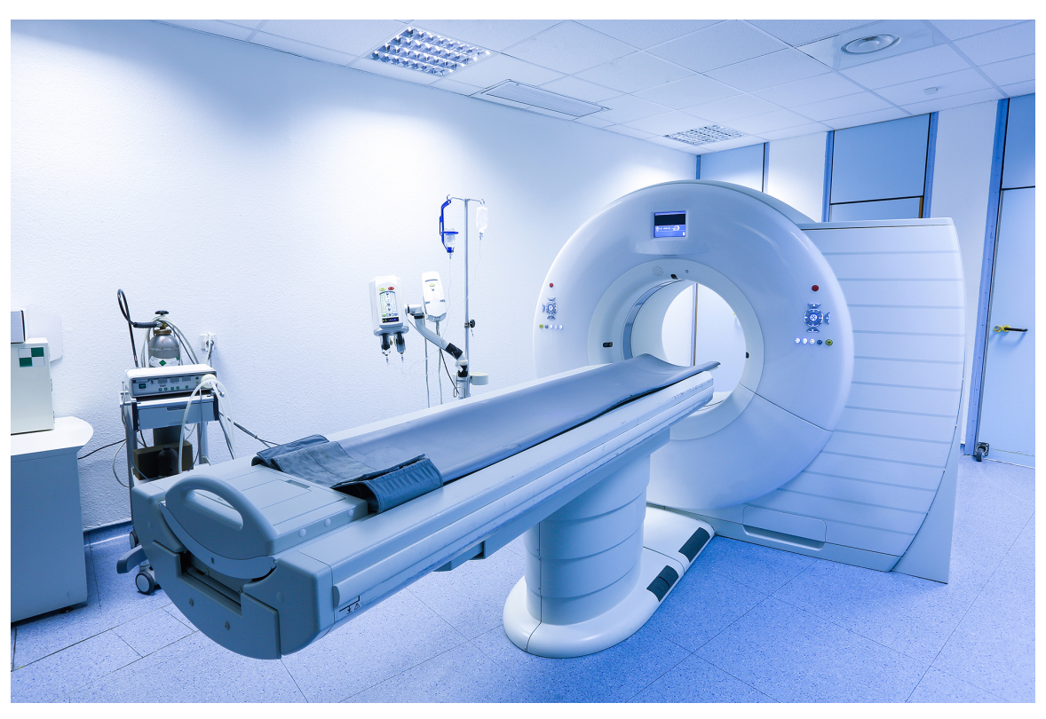
Figure 1. A CT scanner suitable for imaging the abdominal cavity and liver.