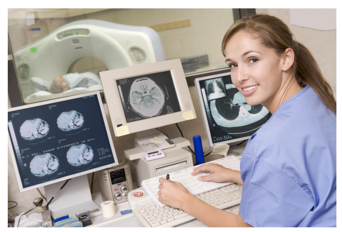
Figure 3. A nurse during a CT examination with the operating software visible. The monitor on the left displays example slices of the abdominal cavity and liver. Liver slices are shown in more detail in Figure 4.