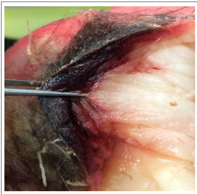
Figure 4 Case 2: image obtained post mortem demonstrating the full extent of the eschar, extending the entire layer of the dermis