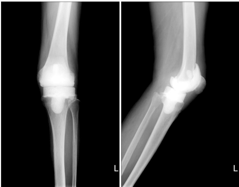
Fig. 1. Radiographs showing a mobile cement spacer.

In the septic complication group, two-stage reimplantation was performed using mobile antibiotic impregnated cement spacers (Fig. 1). If an infection was diagnosed, implant removal and debridement were thoroughly performed in the operating room. The kind of antibiotics used for the cement spacer in the first stage procedure was decided as those sensitive to cultured organisms. In the cases with negative culture results, 2 g of vancomycin was mixed with 40 g bone cement containing 1 g erythromycin. In the cases with suspected fungal infection, 50 mg of amphotericin was added. The cement spacer was created using each package of bone cement for the tibial area and femoral area. If the preoperative culture was positive, sensitive antibiotics were intravenously injected; if negative, 1 g of first generation cephalosporins was administered. The antibiotics were changed according to the intraoperative culture and then intravenous administration was continued for 6 weeks. The second-stage reimplantation was planned when systemic symptoms accompanying knee pain, burning sensation, open wounds and fistulas disappeared and laboratory findings such as WBC, ESR, and CRP were normal in more than two consecutive assessments performed with an interval of 1 month. The final revision procedure was performed if 1) less than 5 polymorphonuclear leukocytes were observed in the intraoperative frozen section biopsy of specimens taken from