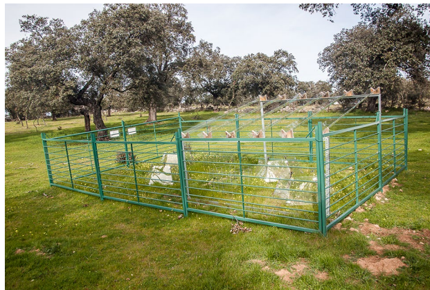
Figure 2. Experimental design. Picture showing open top chambers and rain-exclusion shelters used for our climate manipulations.

in quadrats subjected to warming (see above). Due to lack of plant material, we only sampled 127 out of the 144 quadrats. In total, we collected 436 samples from 28 annual plant species (Table S1). Immediately after collection, we oven-dried leaves for 48 h at 40 °C, ground them with liquid nitrogen, and stored them at room temperature before conducting chemical analyses.