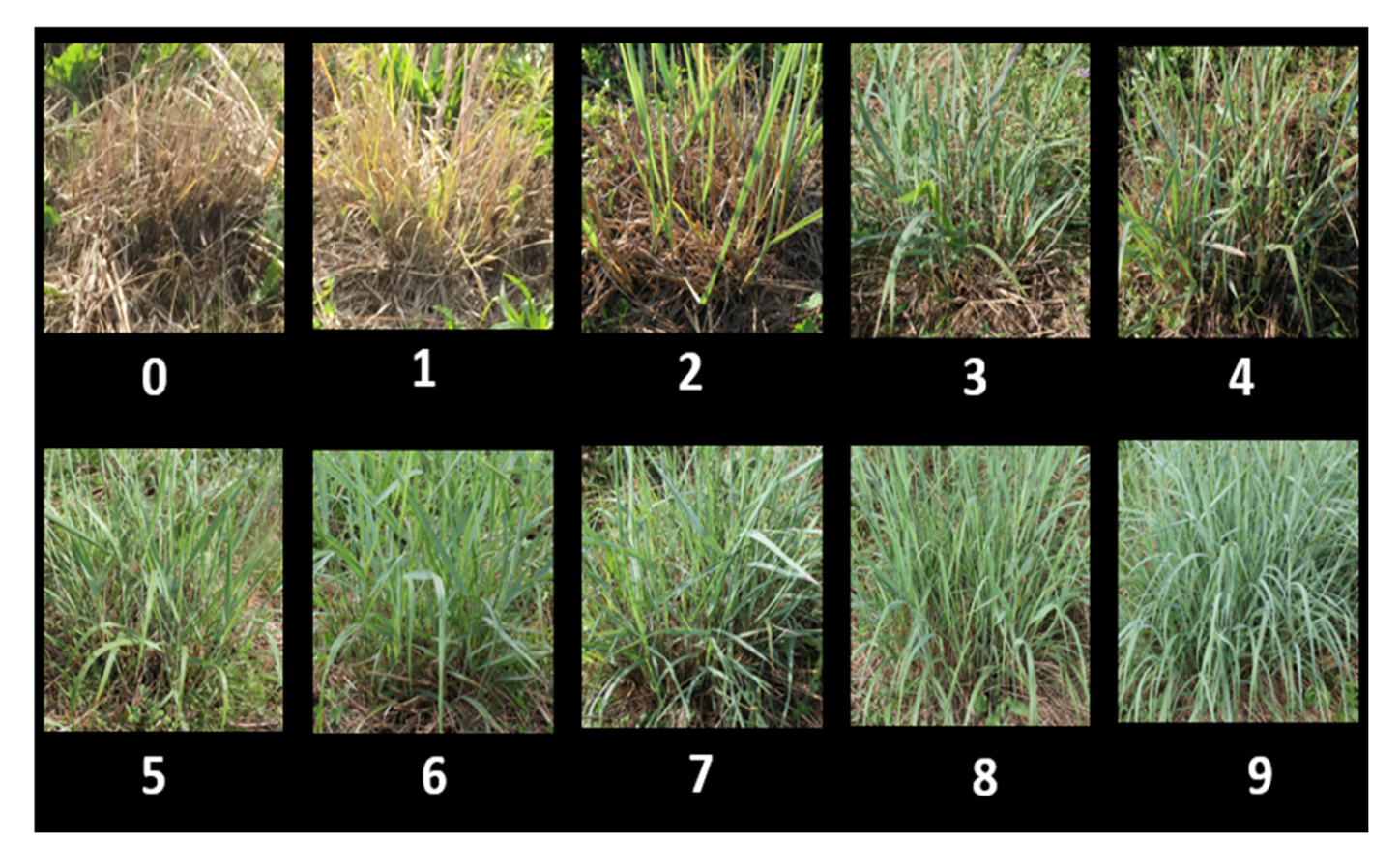
Figure 3. Regrowth vigor scoring scale (0 to 9 rating scale: 0 = no regrowth, 1 = the least vigorous, 9 = the most vigorous).

The plant materials were harvested under a one cut system from 2013 to 2016 to fulfil research objectives for the DOE-funded project. Afterwards, the plant materials were clipped twice per year to understand the genetics underlying regrowth vigor under multiple harvest management systems. In the year of 2017, the plants were clipped in July, and regrowth vigor was recorded in August 2017, i.e., 30 days after clipping. After recording the 2017 regrowth vigor data, the plants were clipped again in November. In 2018, the plants were clipped in August, and regrowth vigor was recorded in September 2018. The regrowth vigor of each plant was recorded using a scale from 0 to 9 (0 = no regrowth, 1 = the least vigorous regrowth, 9 = the most vigorous regrowth) (Figure 3) from each replication in each year. The data from replication 1 represent the regrowth vigor of the population after the fourth and fifth year of planting (or after five and seven clippings), while data from replication 2 represent regrowth vigor after the third and fourth year of planting (or after four and six clippings).