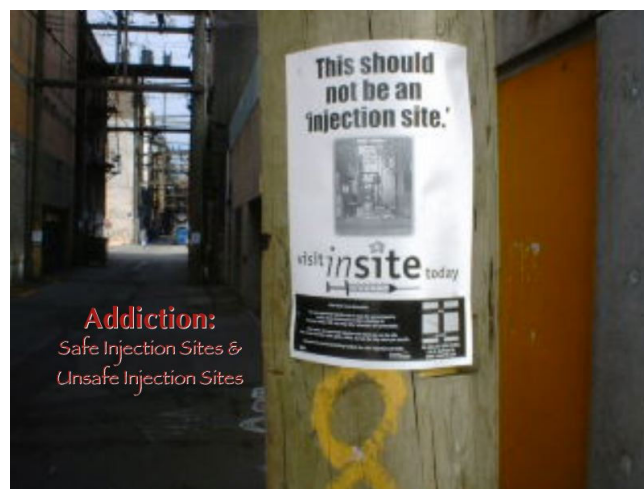
Figure 2 Educational poster in an alley. A poster placed by the WND in the alleys in Vancouver describing a safer place to inject drugs under the supervision of medical personnel.

People with active addictions are recruited from the street level to engage in low threshold positions in syringe dis-