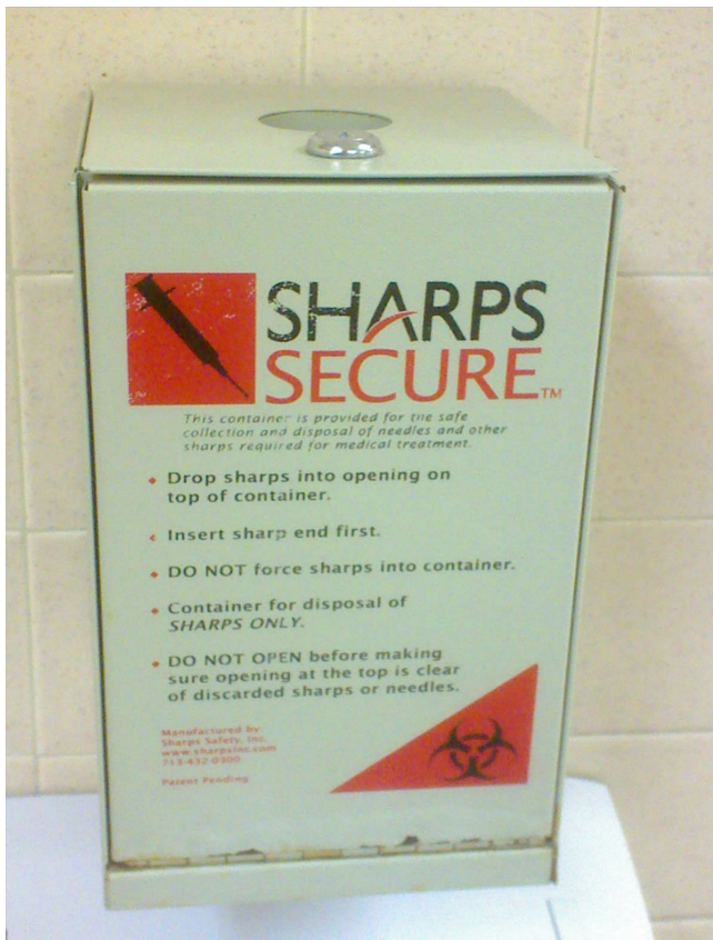
Figure 3 Syringe receptacle at Seaworld. A photograph showing a syringe receptacle in the bathroom at the Seaworld public attraction.

In fact, a culture change in terms of our understanding about the process of retrieving syringes has occurred in the past ten years in Vancouver. Rather than linking the retrieval process to the point of distribution, the addict, we were separating the process of recovering used syringes from distributing new ones. It has become clear that retrieval of used needles is a practical matter of sanitation and public safety rather than something that has to be tied to needle exchange. This process was taking place at many levels. The City of Vancouver, for example, installed a needle receptacle, in the artful shape of a daisy, in a park adjacent to the Downtown Eastside during this period (see Figure 4). In analogy, if there is a problem with too much garbage in public parks, then it is a suitable public response to install more garbage cans. Similarly, with a