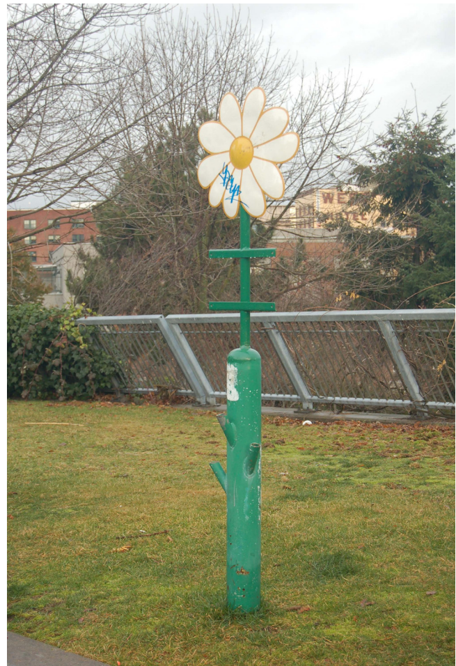
Figure 4 Daisy receptacle. A repository for used syringes installed in a Vancouver park.

goal to recover as many used syringes from the public spaces as possible, there can be increasing resources dedicated to this issue with a practical response: more receptacles for dirty needles and more people paid to pick them up with gloves and tongs. Needle receptacles were placed throughout the public spaces wherever addicts might require them and roving teams called "needle sweeps" were created. The VCH began to keep track of each area of the City of Vancouver as a separate zone to determine "hot spots" where more attention to needle pick-up might be required. Today it is also the standard of practice to install and maintain receptacles to retrieve used syringes within social (government funded) housing in Vancouver.