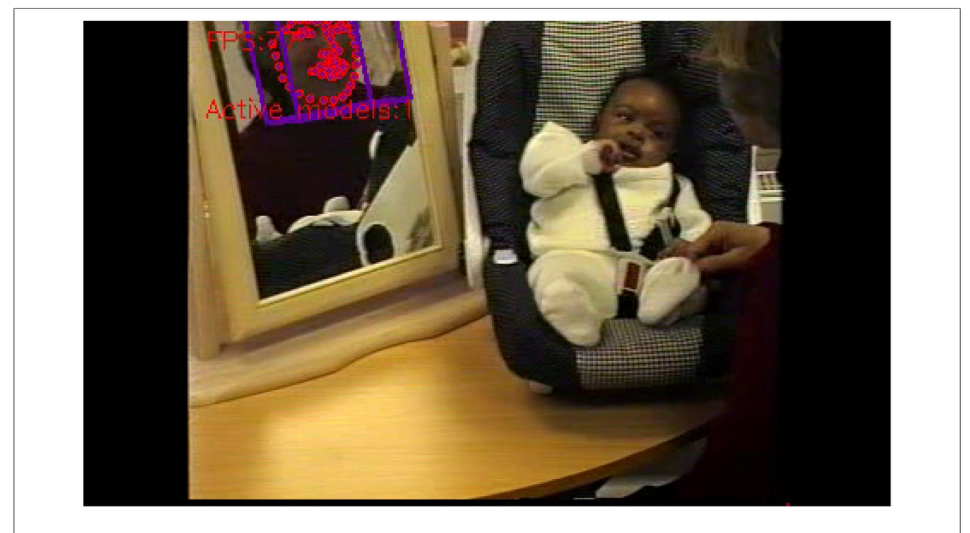
FIGURE 4 | The researcher's face is recognized within seconds, without failure. The baby's face is recognized only after a long time, and with repeated short failures.

FIGURE 3 | The faces of mother and baby remain unrecognized after minutes, leading to serious vision parsing failure.