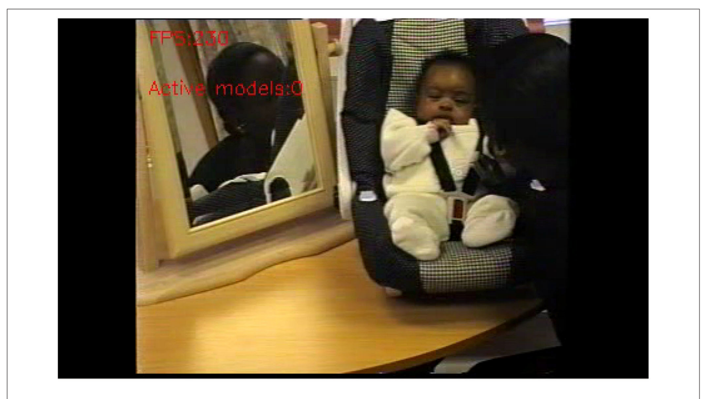
FIGURE 3 | The faces of mother and baby remain unrecognized after minutes, leading to serious vision parsing failure.