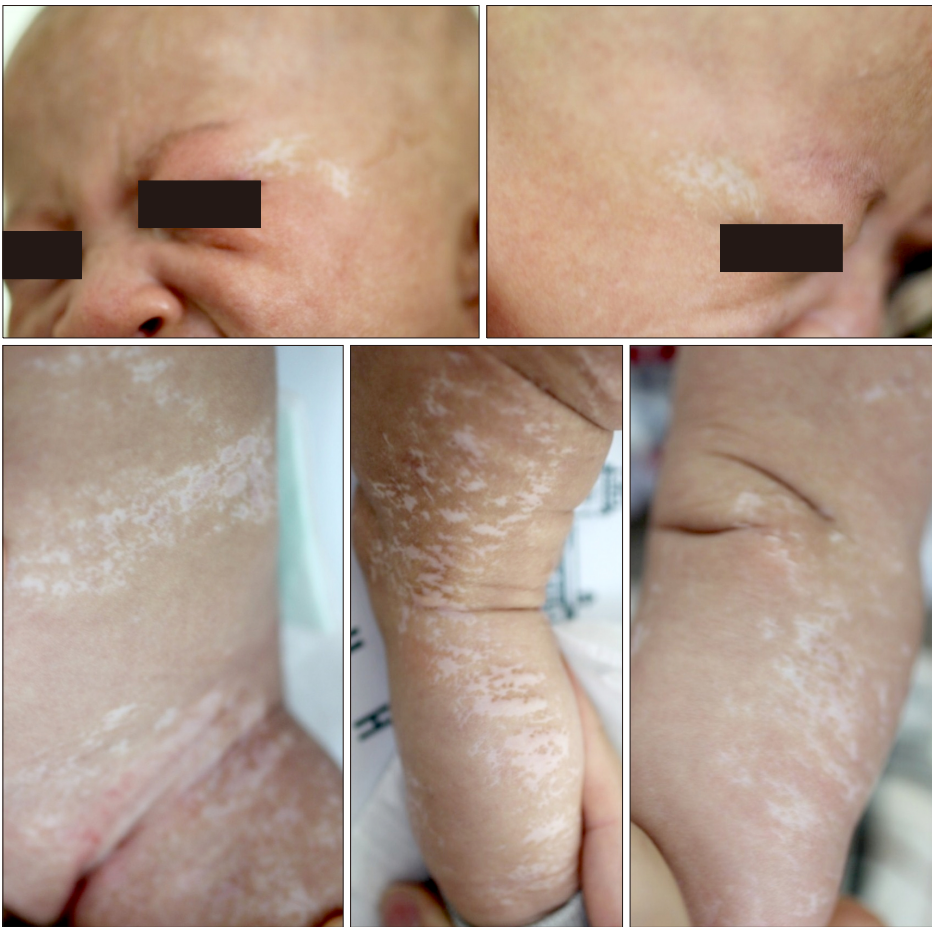
Fig. 1. Linear, hypopigmented patches with irregular border on the face, scalp, trunk, and both extremities.