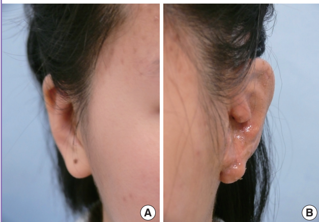
Fig. 4. Long-term follow-up appearance after 17 years

(A) Normal side. (B) The appearance of the patient 2 years and 2 months after ear elevation. The symmetry of both ears has been sustained very well.