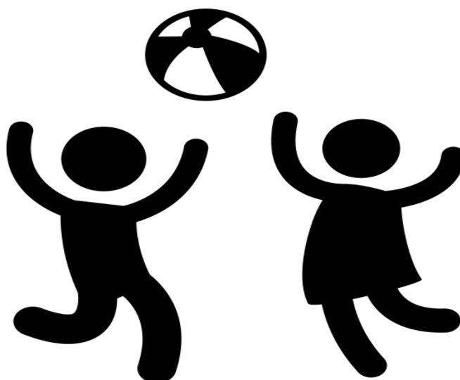
Figure A1. Emotional loneliness.

Created by Gan Khoon Lay from Noun Project