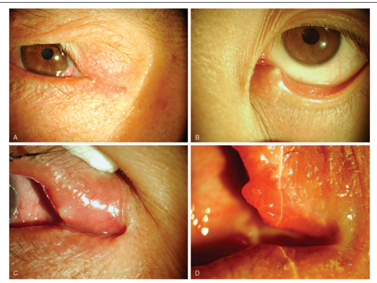
Figure 1. Clinical signs of canaliculitis concretions. (A) Medial canthal swelling of the affected eyelid. (B) Punctal dilation and mucopurulent discharge. (C) The upper punctum erythema and punctal regurgitation with mucopurulent discharge. (D) The affected eyelid inflammatory congestion and punctal granulomatous lesion.

irrigation of the affected canaliculus in 21 of 36 patients (58.3%) revealed some degree of resistance (Fig. 1).