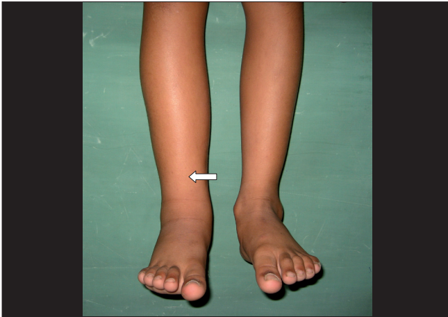
Figure 1: 'Lymphedema' of the right lower limb, confined to below-knee level and asymmetric