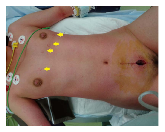
Fig. 1. The patient had a rash on the trunk of her body and arms, and also subcutaneous bleeding in the area from where the ECG pads had been removed (arrows).