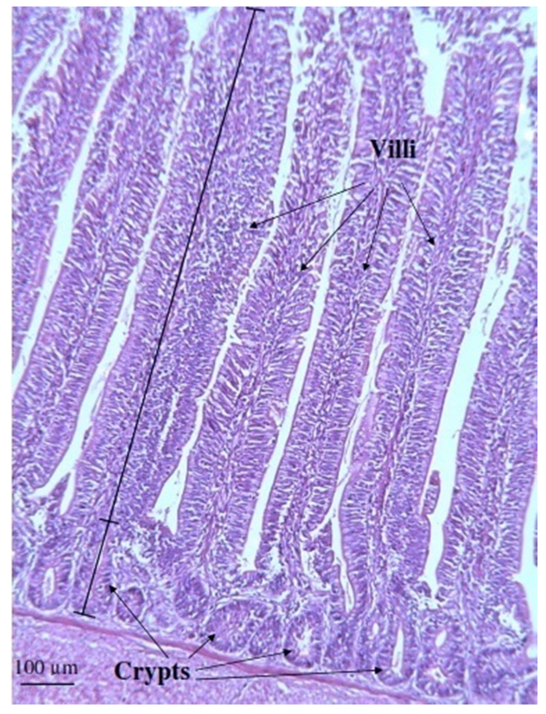
Fig 3. A representative photomicrograph showing intestinal villi and crypts of a broiler (fed diet supplemented with 1 g kg<sup>-1</sup> of a mixture of L. salivarius Cl1, Cl2 and Cl3) at 42 d of age. Villus height was measured from the top of the villus to the villus-crypt junction (long bar). Crypt depth was measured as the distance between the basement membrane and the mouth of crypt (short bar).

https://doi.org/10.1371/journal.pone.0175959.g003