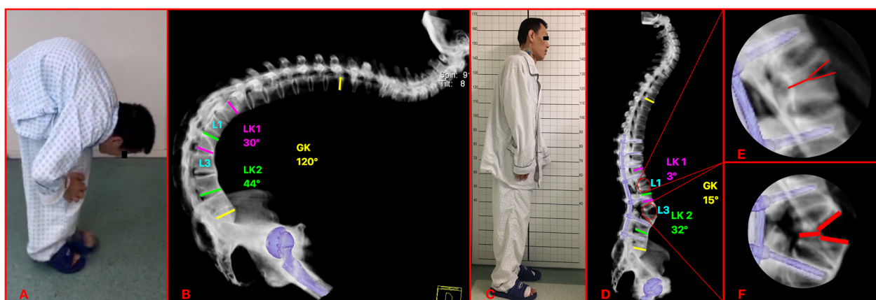
Fig. 3 Two-level VCD osteotomy in a 38-year-old man: preoperative clinical photo (a) and radiographs (b) show 120° global kyphosis. Postoperative clinical photo (c) and lateral radiograph (d) after two-level VCD performed at L1 and L3 show his excellent sagittal alignment with the global kyphosis corrected to 15° and the osteotomy vertebrae were posterior column closing with anterior column opening just like shape “Y” (e, f). The local kyphosis of superior osteotomy vertebra (LK1) improved from preoperative 30° kyphosis (b) to postoperative 3° lordosis (d) and local kyphosis of inferior osteotomy vertebra (LK2) from preoperative 44° kyphosis (b) to postoperative 32° lordosis (d)

All patients could walk with horizontal vision and lie on their backs postoperatively. A one-level osteotomy was performed in 339 patients, and a two-level osteotomy was performed in the remaining 89 patients (Table 1).