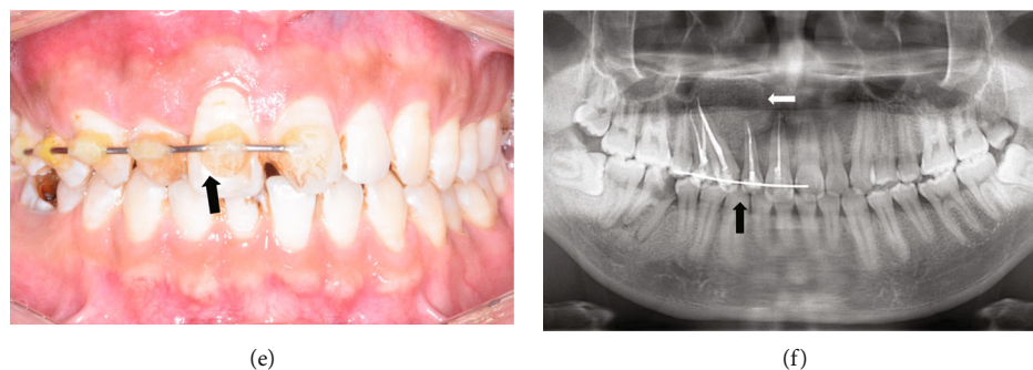
FIGURE 1: A 24-year-old male presenting with odontogenic keratocyst in the right maxilla involving 4 teeth (case 4). (a) Routine panoramic radiograph revealed a maxillary lesion with well-defined lesion, involving #11, 12, 13, and 14 (white arrow). (b) CBCT examination showed that #11, 12, 13, and 14 lost bone support (white arrow). (c) #15, 14, 13, 12, 11, and 21 were splinted before surgery (black arrow). (d) There is a large bone defect caused by lesion and surgery, and teeth had minimal bone support (white arrow). But no tooth was avulsed or excessive mobile during surgery, and the splint was fixed well on the teeth (black arrow). (e) One month after surgery, the resin of the splint had slight discoloration (black arrow). (f) Teeth were preserved, and bone defect was filled with biomaterial (white arrow).

occlusion, and allow an easy assessment of teeth on follow-up visits [11, 18]. However, adhesive bases on acid etching may damage the enamel to some extent, and it is still unclear whether splints would develop orthodontic forces [11]. Besides, wire-composite splints are predisposed to gingivitis, which is mostly reversible, but might cause marginal alveolar resorption if the fixation prolonged [11]. Thus, it is necessary to confirm the patients' good compliance and make sure that they would come back to have the splints removed before splinting starts. Therefore, splinting of teeth for jaw curettage surgery should be seen with caution and might be restricted to teeth with high risk of getting lost, especially teeth with mobility and large bone defects caused by benign lesion combined with periodontal diseases.