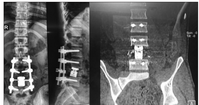
Figure 3: Two years postoperation computed tomography scan show good construct stability and solid bony fusion have been maintained with acceptable lumbar lordosis loss