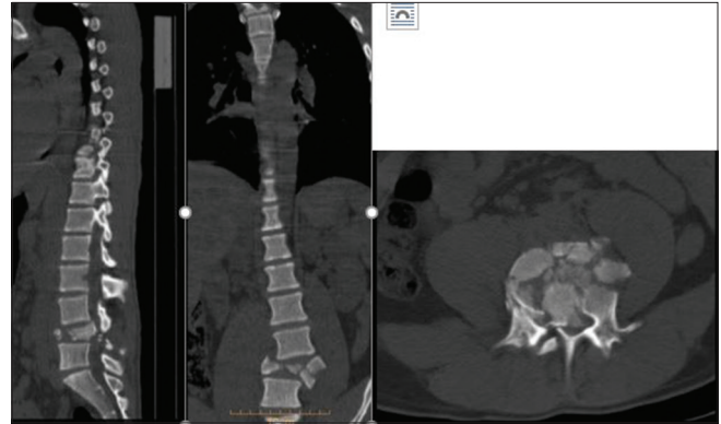
Figure 1: Sagittal, axial and coronal computed tomography scan revealed severe L4 burst fracture with completely canal compromise and posterior element involvement and decrease normal lumbar lordosis

to ambulate independently and was discharged on the 2 postoperative days. At 2-year postoperatively, construct stability and solid bony fusion have been maintained with no further lordosis loss of the lumbosacral in control CT scan, and the patient was symptom-free at this period and return to his normal daily work [Figure 3].