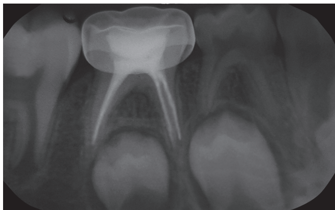
Fig. 1: Optimally filled canal obtained with modified conventional shaping technique

Postoperative radiographs were obtained for each tooth using same radiographic settings described for the preoperative radiographs.