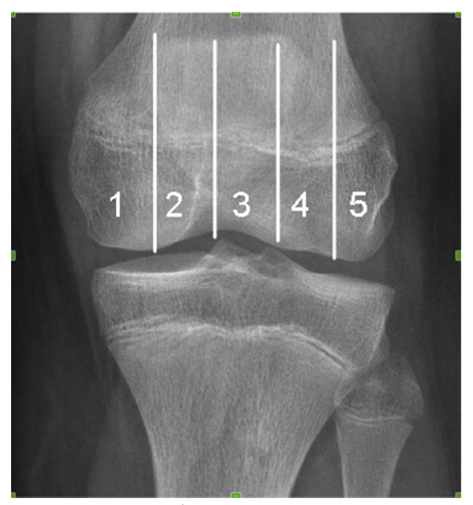
Fig. 1 Cahill and Berg<sup>9</sup> areas of the knee in anteroposterior projection: areas 1 and 2 are in the medial condyle, area 3 is the central zone bordered by the intercondylar tibial eminences, and areas 4 and 5 are in the lateral condyle.

The stability of the lesion was classified using the radiographs and MRI images, according to the criteria of Dipaol, Nelson and Colville.<sup>10</sup> Groups I and II are stable forms, while groups III and IV are considered to be unstable forms.<sup>10–12</sup>